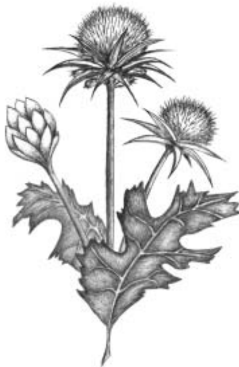
Figure 1. Milk Thistle

The active constituents of milk thistle are flavonolignans including silybin, silydianin, and silychristine, collectively known as silymarin. Silybin (Figure 2) is the component with the greatest degree of biological activity, and milk thistle extracts are usually standardized to contain 70-80 percent silybin. Silymarin is found in the entire plant but is concentrated in the fruit and seeds. Silybum seeds also contain betaine (a proven hepatoprotector) and essential fatty acids, which may contribute to silymarin's anti-inflammatory effect.