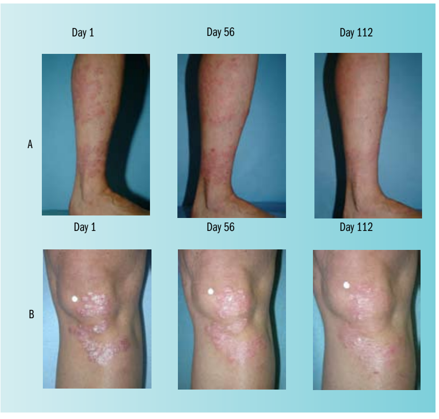
Figure 2. Two patients treated with XP-828L (2.5 g twice daily). A) Patient MB001 of Group A. B) Patient LT036 of group A.

Psoriasis has a T lymphocyte-based immunopathogenesis.<sup>15</sup> The response of psoriasis to treatment compounds that act on lymphocytes such as cyclosporine,16 DAB389IL-2,17 alefacept,18 efalizumab,19 or, in some cases, CD4 antibodies<sup>20</sup> confirms the major role of T cells in the pathogenesis of psoriasis. Anti-tumor necrosis factor agents (etanercept, infliximab, adalimumab) also have a proven efficacy.21 However, these specific products are not appropriate for mild psoriasis owing to potential side effects and the high costs of treatment. There is a need for a safer and more appropriate therapy for patients with psoriasis. The bioactive profile of XP-828L could be related to the presence of growth factors, active peptides, and immunoglobulins in the extract. In vitro experiments showed that XP-828L inhibits the production of T helper 1 cytokines (IFN- \gamma and IL-2), suggesting that XP-828L could improve Thelper