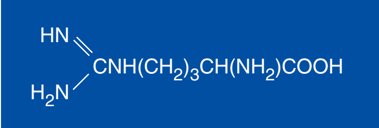
Figure 1. Structure of Arginine

tory response,<sup>20</sup> apoptosis,<sup>21</sup> and protection against oxidative damage.<sup>22</sup> Arginine is also a critical component of vasopressin (anti-diuretic hormone).