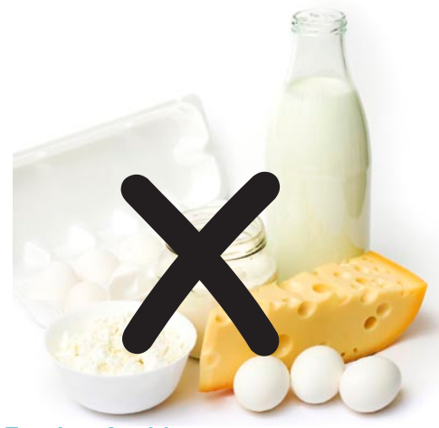
Food to Avoid