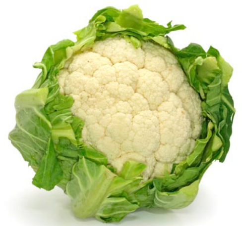
Food to Include