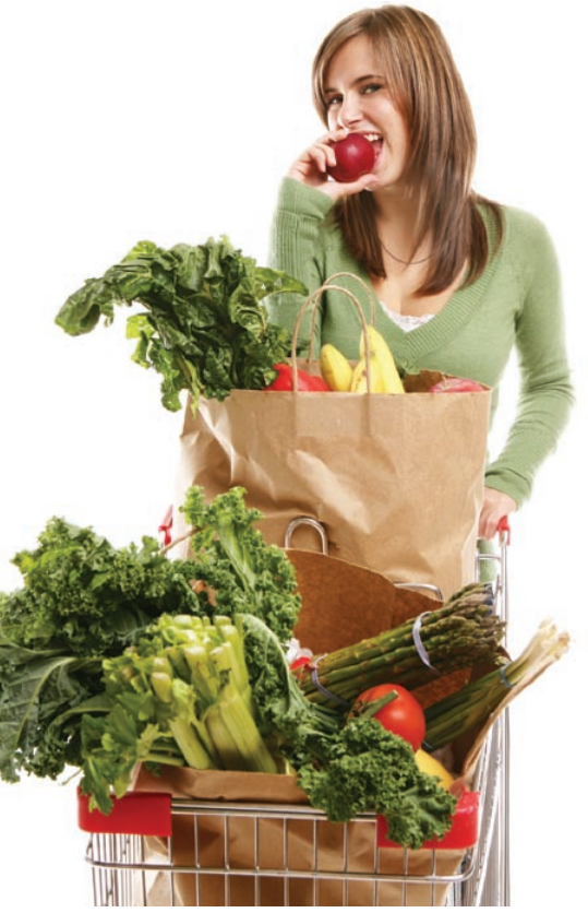
MediClear Patient Guide — Page 7

Now you are in the home stretch! The meats, fish, and legumes you eliminated during the second week may now be reintroduced.