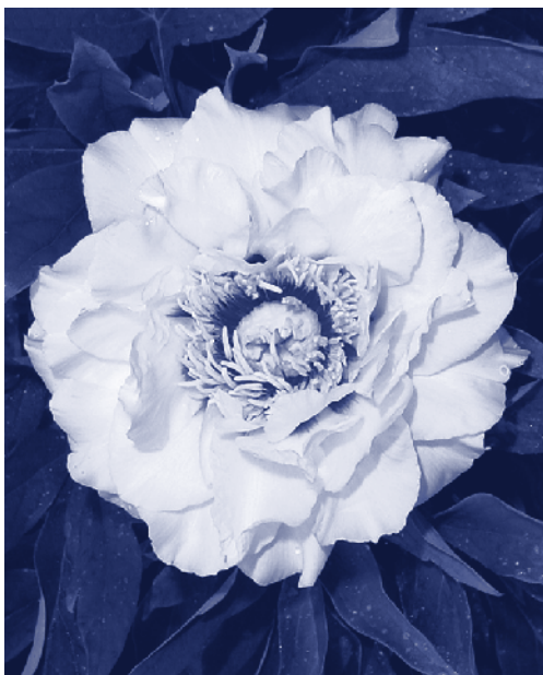
Paeonia suffruticosa (Tree Peony)