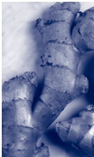
Zingiber officinale (Ginger root)