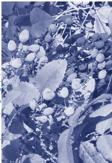
Berberis aquifolium (Oregon grape)